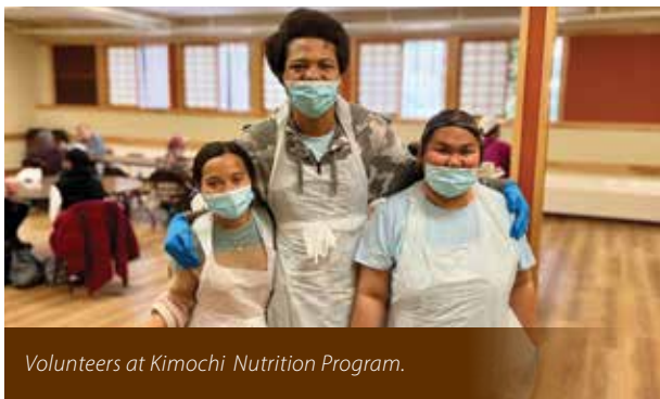
Volunteers at Kimochi Nutrition Program.