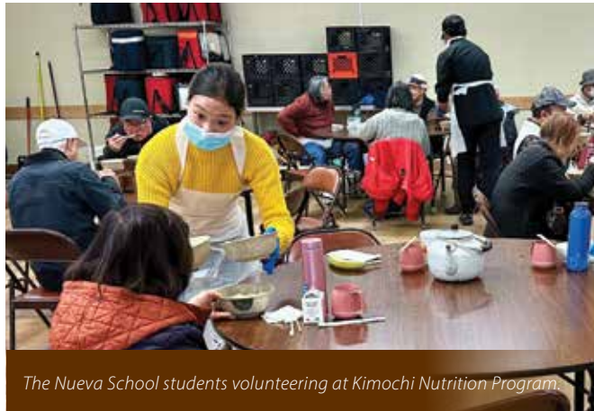
The Nueva School students volunteering at Kimochi Nutrition Program.