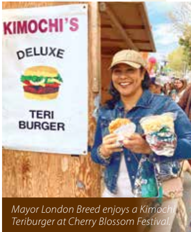
Mayor London Breed enjoys a Kimochi Teriburger at Cherry Blossom Festival.