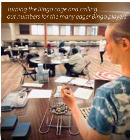
Turning the Bingo cage and calling out numbers for the many eager Bingo players.